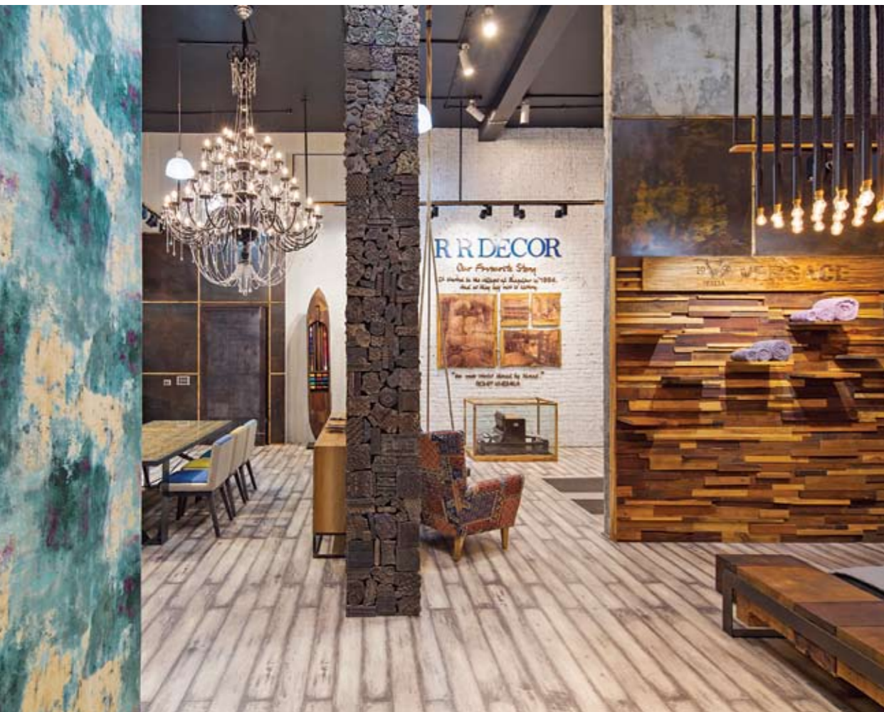
A glimpse of RR Décor: Efficient use of space in the most aesthetic way.